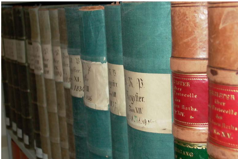
View into the state government archives

Records, books, and departmental prints from the cantonal administration arranged by subject content (principle of pertinence).