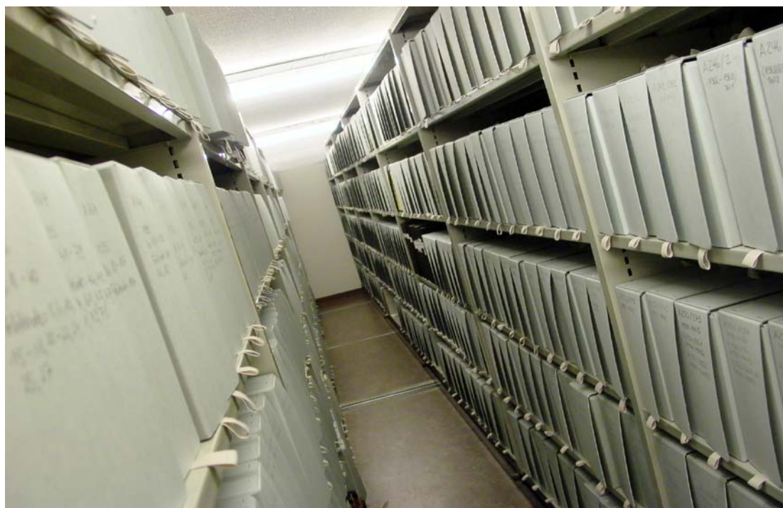
Processed records of the administration

The State Archives advises authorities and state agencies already at the records creation and management stage, thereby contributing to modern, transparent, and efficient administrative procedures. In this phase valuable information can be secured for archival custody later.